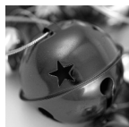
HOLIDAY POPS! Orchestra & Chorale Dec. 3 & 4, 2011